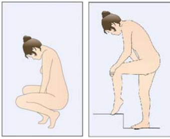
Figure 1: Positions for NuvaRing insertion