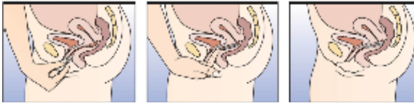
Figure 3: Inserting NuvaRing.

Although some women may be aware of NuvaRing in the vagina, most women do not feel it once it is in place. If you feel discomfort, use your finger to gently push NuvaRing further into your vagina. There is no danger of NuvaRing being pushed too far up in the vagina or getting lost.